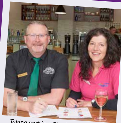
Taking part in a Charity Quiz night at Rumwell Farm Shop © Rumwell Farm Shop.

www.ageuksomerset.org.uk/fundraisingevents